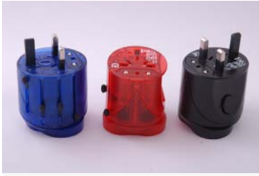
This is the type of adapter you need.

The standard electrical plug has 3 rectangular pins so remember to pack an adapter. Transformers and local surge suppressors are a good idea to protect your electronic equipment.